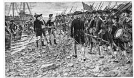
Brigadier-General Richard Montgomery's troops prepare to embark for the invasion of Canada from Crown Point, New York

Both the Americans and the British misunderstood the nature of Canadien (as French Canadians were then known) society. [11] The feudal nature of Canadien society with the seigneurs and the Catholic Church owning the land led the British to assume the habitants – as the tenant farmers who made up the vast majority of Quebec's population were known – would deferentially obey their social superiors while the Americans believed that the habitants would welcome them as liberators from their feudal society. In fact, the habitants , despite being tenant farmers, tended to display many of the same traits displayed by the farmers in the 13 colonies who mostly owned their land, being described variously as individualistic, stubborn, and spirited together with a tendency to be rude and disrespectful of authority figures if their actions were seen as unjust. [11] Most of the habitants wanted to be neutral in the struggle between Congress vs. the Crown, just wanting to live their lives in peace. [11] Carleton's romanticized view of Canadien society led him to exaggerate the willingness of the habitants to obey the seigneurs as he failed to understand that the