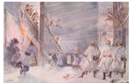
Defending Quebec from an American attack

The presence of disease in the camp outside Quebec, especially smallpox , took a significant toll on the besiegers, as did a general lack of provisions. [93] Smallpox ravaged Montgomery and Arnold's forces largely due to exposure to infected civilians released from Quebec. Governor Carleton condoned this practice, realizing it would severely weaken the American siege effort. [94] Carleton is reported to have sent out several prostitutes infected with smallpox who in turn passed it on to the Continental Army. [90] Arnold after using up all his gold could only pay for supplies with paper money, not coin, which proved to be problematic as the habitants wanted coins, and increasing the Americans had to