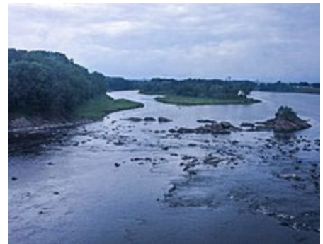
Chaudière River, Arnold's route.

After first rejecting the idea of an attack on Quebec, the Congress authorized the Continental Army's commander of its Northern Department, Major General Philip Schuyler , to invade the province if he felt it necessary. On 27 June 1775 approval for an invasion of Canada was given to Schuyler. [15] As part of an American propaganda offensive, letters from Congress and the New York Provincial Assembly were circulated throughout the province, promising liberation from their oppressive government. [16] Benedict Arnold, passed over for command of the expedition, convinced General George Washington to authorize a second expedition through the wilderness of what is now the state of Maine directly to Quebec City , capital of the province. [17] The plan approved by Congress called for a two-pronged attack with 3,000 men under Schuyler going via Lake Champlain and the Richelieu River valley to take Montreal while 1,050 men under Arnold would march up the Kennebec River valley, over the Height of Land and then down the Chaudière River valley to take Quebec City. [18]