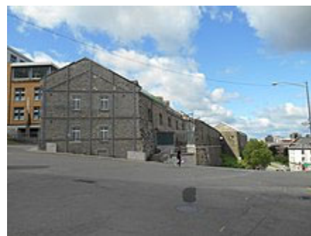
The Palais gate used to stand by the artillery barracks.