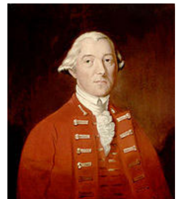
Guy Carleton, commander of the forces in the city (painter unknown)

General Carleton had begun preparing the province's defenses immediately on learning of Arnold's raid on St. Jean. On 9 June 1775 Carleton proclaimed martial law and called out the militia. [25] At Montreal, Carleton found that there were six hundred men of the 7th Foot Regiment fit for duty, but he complained that there were no warships on the St. Lawrence, the forts around Montreal in a state of disrepair and through the seigneurie and the Catholic Church were loyal to the Crown, most of the habitants appeared indifferent. [25] Although Carleton concentrated most of his modest force at Fort St. Jean, he left small garrisons of British regular army troops at Montreal and Quebec. [26] To provide more manpower, Carleton raised the Royal Highland Emigrants Regiment, whom he recruited from the Scottish Highland immigrants in Quebec. [27] The commander of the Royal Highland Emigrants, Allan Maclean , was a Highlander who had fought for the Jacobites in the rebellion of 1745, and turned out to be Carleton's most aggressive subordinate in the campaign of 1775–76. [28] On 26 July 1775, Carleton met Guy Johnson, the superintendent of the northern district of the Indian Department together with an Indian Department official, Daniel Claus, and a Mohawk war chief Joseph Brant. [29] Johnson, Claus and Brant had brought with them some 1, 600 warriors whom they proposed to lead into a raid into New England, arguing that this was the