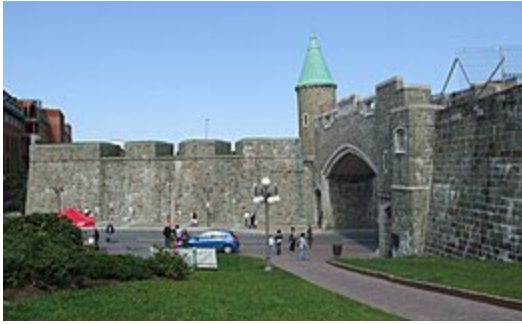
The St. John's gate was the site of James Livingston's feint.