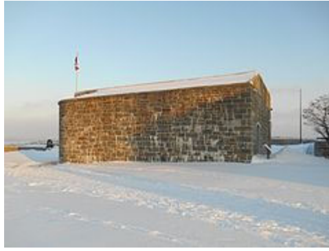
Cap Diamant redoubt.