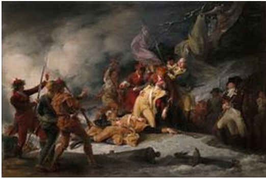
The Death of General Montgomery in the Attack on Quebec, December 31, 1775 , painting by John Trumbull , 1786