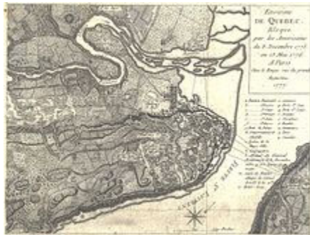
A 1777 French map depicting the points of action in and around Quebec