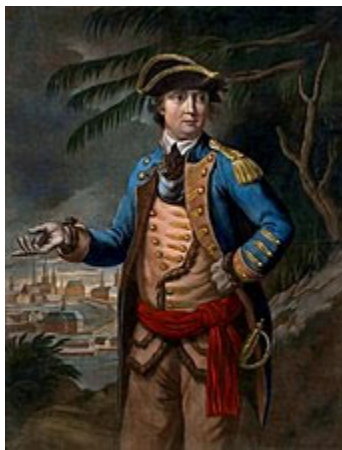
Benedict Arnold in 1776, mezzotint engraving by Thomas Hart

The British believed that the forbidding landscape of upper Massachusetts (modern Maine) was impassable to a military force, but General Washington felt that the upper Massachusetts could be crossed in about 20 days. [49] Arnold called for 200 bateaux (boats) and for "active woodsmen, well acquainted with bateaux". [49] After recruiting 1,050 volunteers, Arnold departed for Quebec City on 5 September 1775. [49] The men Arnold chose for his expedition were volunteers drawn from New England companies serving in the Siege of Boston . They were formed into two battalions for the expedition; a third battalion was composed of riflemen from Pennsylvania and Virginia under Captain Daniel Morgan 's command. [50] After landing in Georgetown on 20 September, Arnold began his voyage up the Kennebec river. [49] Arnold thought it was only 180 miles to Quebec City, but actually the distance was 300 miles and the terrain was far more difficult than he expected. [49]