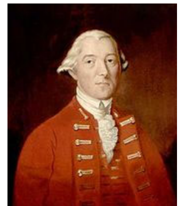
Quebec's Governor, General Guy Carleton

Carleton then launched his own offensive intended to reach the Hudson River , whose navigable length begins south of Lake Champlain and extends down to New York City . Control of the upper Hudson would enable the British to link their forces in Quebec with those in New York, recently captured in the New York campaign by Major General William Howe . This strategy would separate the American colonies of New England from those farther south and potentially quash the rebellion. [8] Lake Champlain, a long and relatively narrow lake formed by the action of glaciers during the last ice age , separates the Green Mountains of Vermont from the Adirondack Mountains of New York . Its 120-mile (190 km) length and 12-mile (19 km) maximum width creates more than 550 miles (890 km) of shoreline, with many bays, inlets and