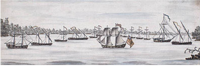
Contemporary watercolor drawing of the American line of battle by Charles Randle. Drawing is titled as follows: New England Armed Vessels in Valcure Bay, Lake Champlain [including Royal Savage , Revenge , Lee , Trumble , Washington , Congress , Philadelphia , New York , Jersey , Connecticut , Providence , New Haven , Spitfire , Boston , and Liberty ] commanded by Benedict Arnold.