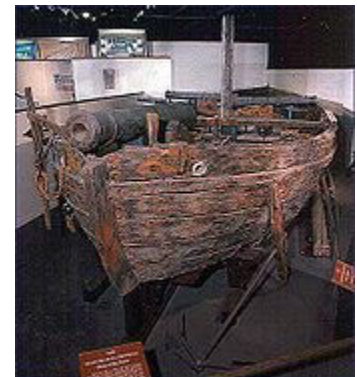
Philadelphia was raised in 1935. It is on display at the National Museum of American History