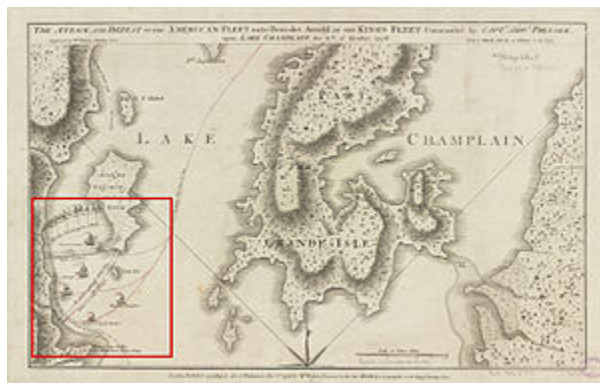
1776 map of Northern Lake Champlain; detail shown above is outlined in red.

Island, Arnold sent out Congress and Royal Savage to draw the attention of the British. Following an inconsequential exchange of fire with the British, the two ships tried to return to Arnold's crescent-shaped firing line. However, Royal Savage was unable to fight the headwinds, and ran aground on the southern tip of Valcour Island. [35] Some of the British gunboats swarmed toward her, as Captain Hawley and his men hastily abandoned ship. Men from Loyal Convert boarded her, capturing 20 men in the process, but were then forced to abandon her under heavy fire from the Americans. [36] Many of Arnold's papers were lost with the destruction of Royal Savage , which was burned by the British. [35][37]