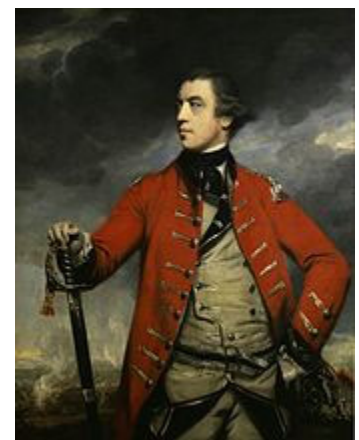
General John Burgoyne arrived with the reinforcements

General John Thomas was unable to move north until late April, due to the icy conditions on Lake Champlain. [69] Concerned about reports of troop readiness and sickness, he made requests to Washington for additional men to follow him while he waited for conditions to improve. Upon his arrival in Montreal, he learned that many men had promised to stay only until April 15, and most of these were insistent on returning home. This was compounded by relatively low enrollments in regiments actually raised for service in Quebec. One regiment with an authorized strength of 750, sailed north with but 75 men. [70] These deficiencies prompted Congress to order Washington to send more troops north. In late April, Washington ordered ten regiments, led by Generals William Thompson and John Sullivan , to go north from New York. This significantly reduced Washington's forces that were preparing for a British attack there. [71] This also exposed transport problems: there were insufficient sailing hands on Lakes George and Champlain to easily move all of these men. Furthermore, there was also a shortage of supplies in Quebec, and much of the shipping was needed to move provisions instead of men. [72] As a result, Sullivan's men were held up at Ticonderoga, and Sullivan did not reach