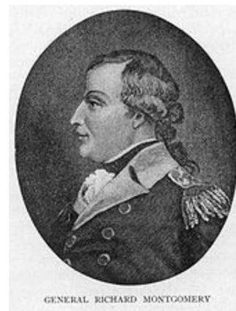
Brigadier General Richard Montgomery