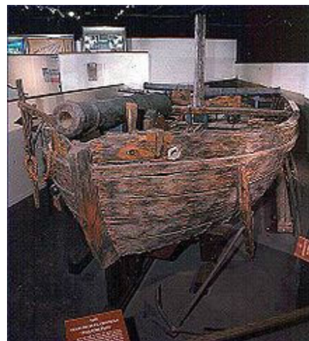
The USS Philadelphia saw action at the Battle of Valcour Island.

While the British assembled a navy to counteract Arnold's, Carleton dealt with matters in Montreal. Even before the Americans retreated from Quebec City, he formed committees to look into the roles played by local Patriot sympathizers, sending them out into the countryside to arrest active participants in the American action, including those who had detained Loyalists. [89] When he arrived in Montreal, similar commissions were set up. [88]