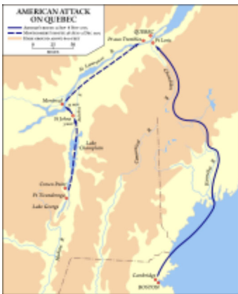
American attack on Quebec: routes of the Arnold and Montgomery expeditions

Before departing Montreal for Quebec City, Montgomery published messages to the inhabitants that the Congress wanted Quebec to join them, and entered into discussions with American sympathizers with the aim of holding a provincial convention for the purpose of electing delegates to Congress. He also wrote to General Schuyler, requesting that a Congressional delegation be sent to take up diplomatic activities. [38]