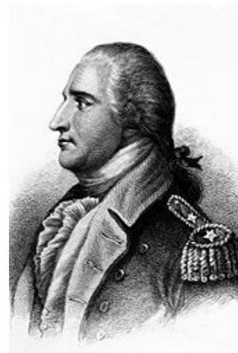
Benedict Arnold was injured in the battle of Quebec.

Montgomery joined Arnold and James Livingston in an assault on Quebec City during a snowstorm on December 31, 1775. Outnumbered and lacking any sort of tactical advantage, the Americans were soundly defeated by Carleton. Montgomery was killed, Arnold was wounded, and many men were taken prisoner, including Daniel Morgan . [50] Following the battle, Arnold sent Moses Hazen and Edward Antill , another expatriate American, to report the defeat and request support to Wooster in Montreal, and also to the Congress in Philadelphia . [51]