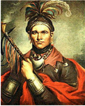
Cornplanter, a Seneca chief, supported the British side, and may have fought in this campaign.

had refused to permit trade with the Indians upriver out of fear that supplies sent in that direction would be used by the British forces there, the congressional delegation reversed his decision and supplies began flowing out of the city up the river. [66]