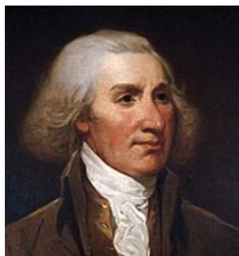
General Philip Schuyler

The First Continental Congress , meeting in 1774, had previously invited the French-Canadians to join in a second meeting of the Congress to be held in May 1775, in a public letter dated October 26, 1774. The Second Continental Congress sent a second such letter in May 1775, but there was no substantive response to either one. [8]