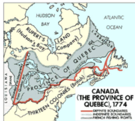
Province of Quebec in 1775

Following the raid on Fort St. Johns, General Carleton was keenly aware of the danger of invasion from the south, and requested, without immediate relief, reinforcements from General Thomas Gage in Boston. He set about raising local