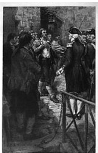
Artist's depiction of Ethan Allen after his capture

Following this first skirmish, General Schuyler became too ill to continue, so he turned command over to Montgomery. Schuyler left for Fort Ticonderoga several days later. [29] After another false start, and the arrival of another 800–1000 men from Connecticut, New Hampshire, and New York, as well as some of the Green Mountain Boys, [30] Montgomery finally began besieging Fort St. Johns on September 17, cutting off its communications with Montreal and capturing supplies intended for the fort. Ethan Allen was captured the following week in the Battle of Longue-Pointe , when, overstepping instructions to merely raise local militia, he attempted to take Montreal with a small force of men. [31] This event resulted in a brief upturn in militia support for the British; but the effects were relatively short-lived, with many deserting again in the following days. [32] After an attempt by General Carleton to relieve the siege failed on October 30, the fort finally surrendered on November 3. [33]