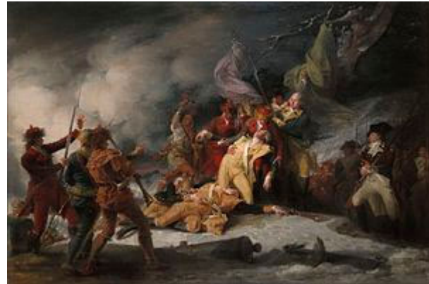
The Death of General Montgomery in the Attack on Quebec, December 31, 1775 (John Trumbull, 1786)