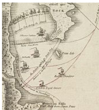
A map detail showing the formations at the Battle of Valcour Island