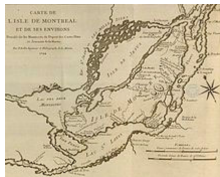
A map of Montreal in 1744

When General Montgomery left Montreal for Quebec City, he left the administration of the city in the hands of Connecticut's Brigadier General David Wooster. While Wooster at first had decent relations with the community, he took a number of steps that caused the local population to come to dislike the American military presence. After promising American ideals to the population, he began arresting Loyalists and threatening arrest and punishment of anyone opposed to the American cause. [59] He also disarmed several communities, and attempted to force local militia members to surrender their Crown commissions. Those who refused were arrested and imprisoned at Fort Chambly. [60] These and similar acts, combined with the fact that the Americans were paying for supplies and services with paper money rather than coin, served to disillusion the local population about the entire American enterprise. On March 20, Wooster left to take command of the forces at Quebec City, leaving Moses Hazen, who had raised the 2nd Canadian Regiment, in command of Montreal until Arnold arrived on April 19. [61]