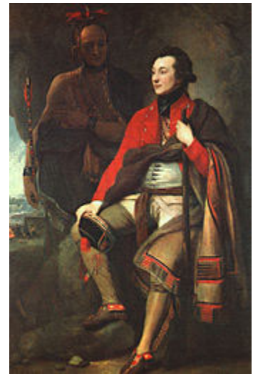
This painting by Benjamin West is usually identified as a portrait of Guy Johnson, although a recent biography of Sir William Johnson claims that it actually depicts Sir William, Guy's uncle. [15]

The primary thrust of the invasion was to be led by General Schuyler, going up Lake Champlain to assault Montreal and then Quebec City. The expedition was to be composed of forces from New York, Connecticut, and New Hampshire, as well as the Green Mountain Boys under Seth Warner , with provisions supplied by New York. [22] However, Schuyler