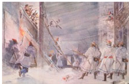
Defending Quebec from an American attack, December 1775