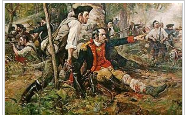
Herkimer at the Battle of Oriskany, August 6, 1777.