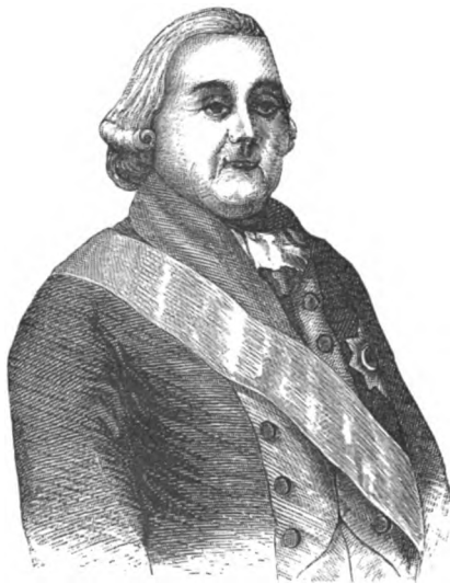
MAJ. GEN. FRIEDRICH ADOLPH RIEDESEL.