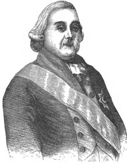
MAJ. GEN. FRIEDRICH ADOLPH RIEDESEL.