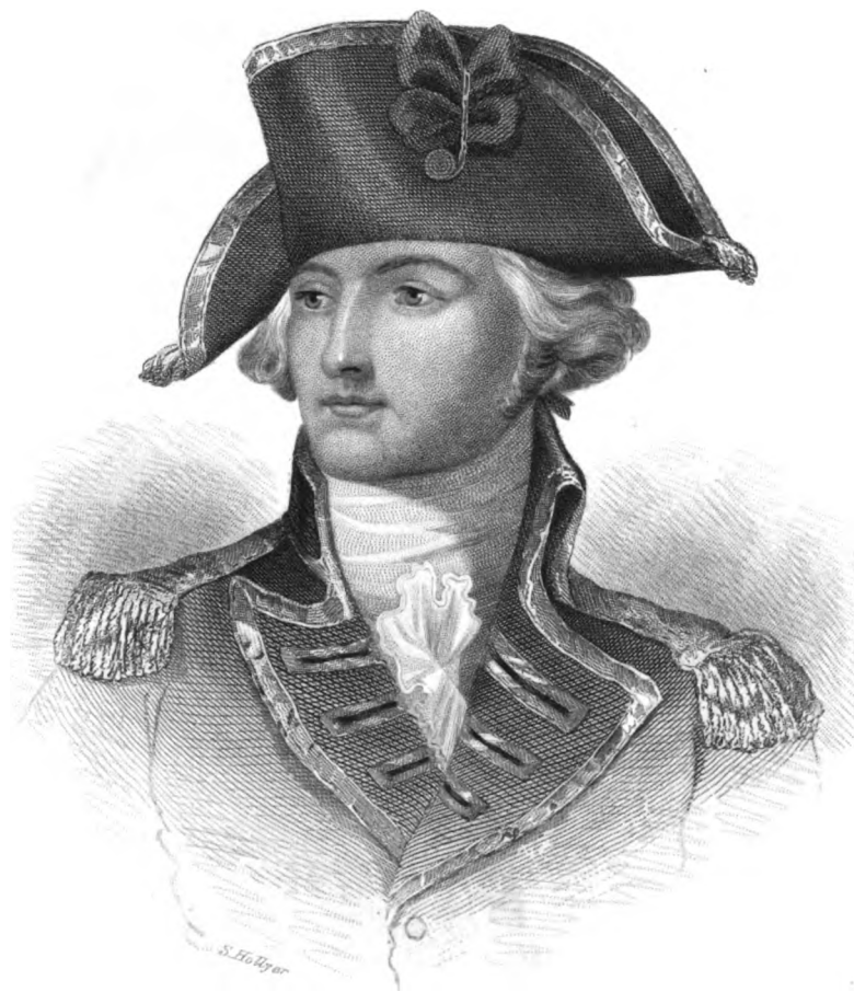
LT. GEN. BURGOYNE.