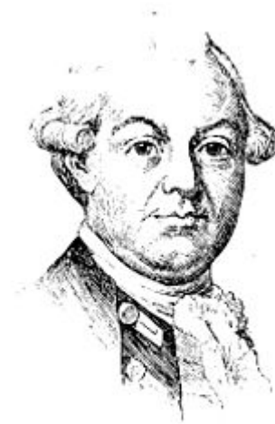
General Simon Fraser