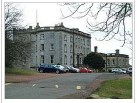
Murdostoun Castle (2006). Hamilton made modifications to it, and it is where he died.

1794 (5 February – 25 March).<sup>[39]</sup> During the battle, the 15th Foot was a